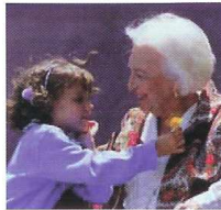
A grandma enjoying a special moment while visiting with her granddaughter at St. Anthony Manor

in organized social events, such as holiday parties and bingo games, as well as exercise classes, shopping trips and group field trips and tours.